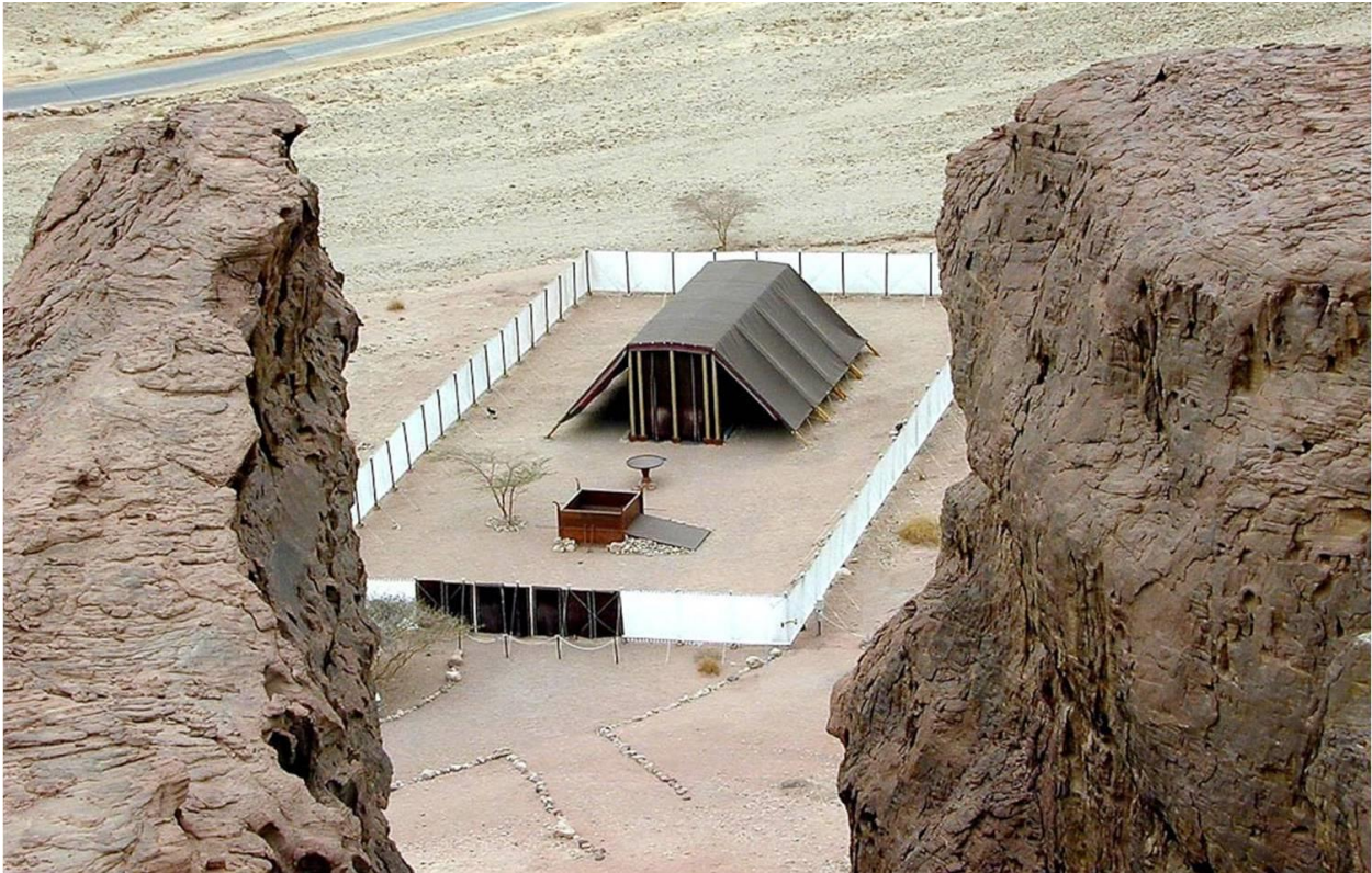
The Tabernacle: An object lesson on Jesus Christ