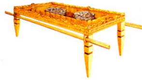
Table of Shewbread: Jesus is the Bread of _____.

Lampstand: Jesus is the true _____ and giver of the Holy Spirit that illuminates God's word